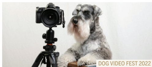
DOG VIDEO FEST 2022

This feature-length documentary explores the life of iconic singer-songwriter Leonard Cohen through a wealth of never-before-seen archival materials. In partnership with The Ryder Film Series and WFHB.