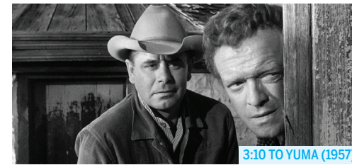
3:10 TO YUMA (1957)

James Mangold's remake of the classic western dials up the action without losing the complex, moral story at the center—thanks in large part to excellent performances by Christian Bale and Russell Crowe.