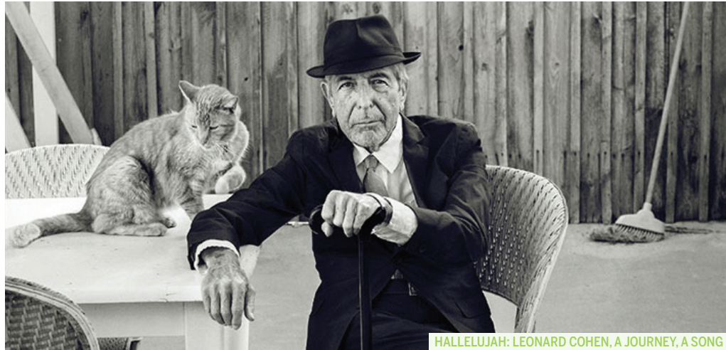
HALLELUJAH: LEONARD COHEN, A JOURNEY, A SONG