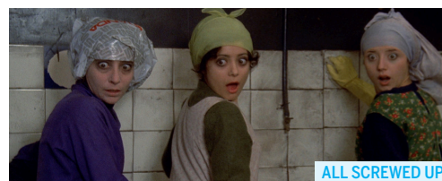
ALL SCREWED UP

Nomi arrives in Las Vegas with only a suitcase and a dream of becoming a showgirl. But as she ascends to the top, Nomi begins to wonder if it's all worth it. Paul Verhoeven's legendary camp cult classic is a delirious, frenetic satire of the American dream.