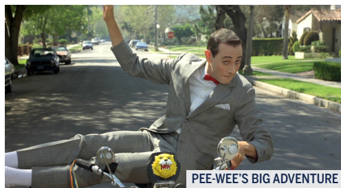
PEE-WEE'S BIG ADVENTURE

Winner, Sundance 2022 World Cinema Grand Jury Prize. In the Bolivian highlands, an elderly Quechua couple face a dilemma: resist or be defeated by the environment and time itself.