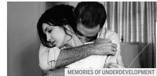
MEMORIES OF UNDERDEVELOPMENT

A man and his daughter search for their missing family amidst a civil war in Abidjan. In partnership with Black Camera ; Center for Documentary Research and Practice; African Studies Program.