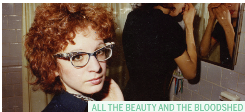
ALL THE BEAUTY AND THE BLOODSHED

Acclaimed look at photographer Nan Goldin's fight with addiction and the institution responsible for her pain.